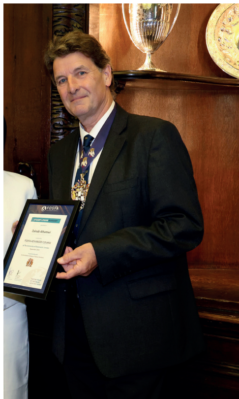
Advanced Course Bursary Winner 2024

Applicants must be eligible to travel to the UK.