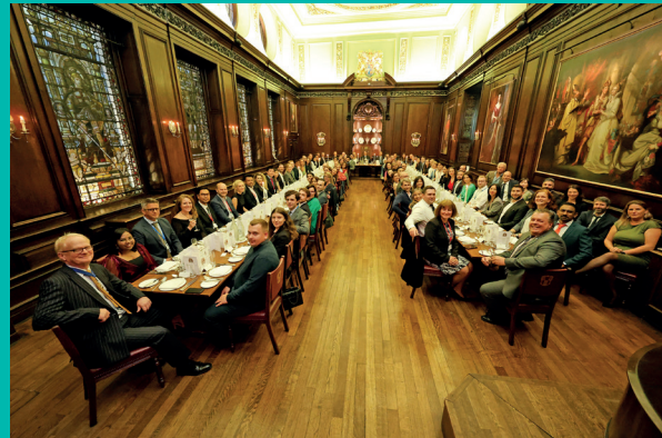
Tallow Chandlers' Education Gala Dinner 2024

Our expert courses are designed for industry professionals including FOSFA contracts, supporting documents, dispute resolution, arbitration shipping, trade finance & technical topics.