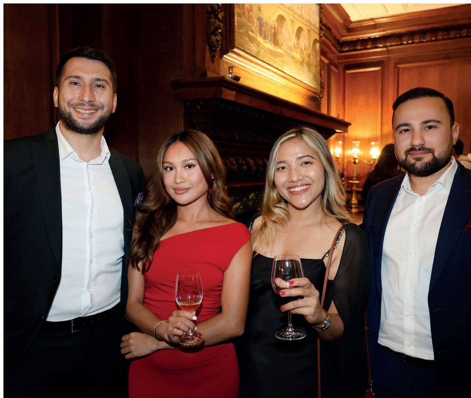
Education Course Delegates