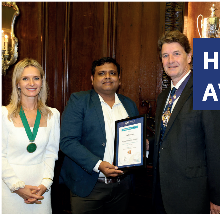
Advanced Course Bursary Winner 2024

Applications will be reviewed and assessed by the FOSFA / Tallow Chandlers Liaison Committee. Their decision will be final.